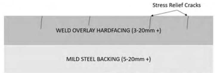
Cross Section of AbrasaPlate